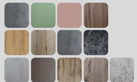
SPECTRUM GLOSS / MATTE protective foil