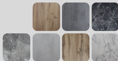
SPECTRUM GLOSS / MATTE

Fronts made of Spectrum boards give the kitchen a modern look, are simple in form, and at the same time elegant and tasteful.