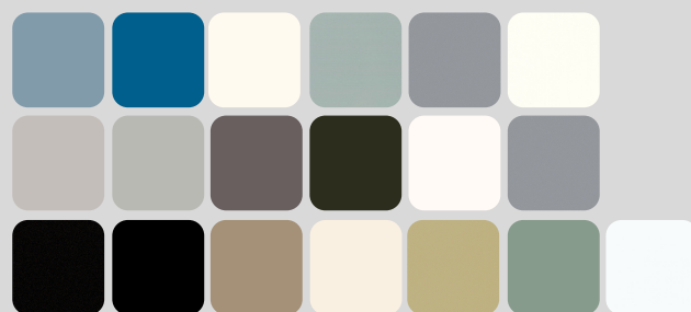
ACRYLUX GLOSS / MAT